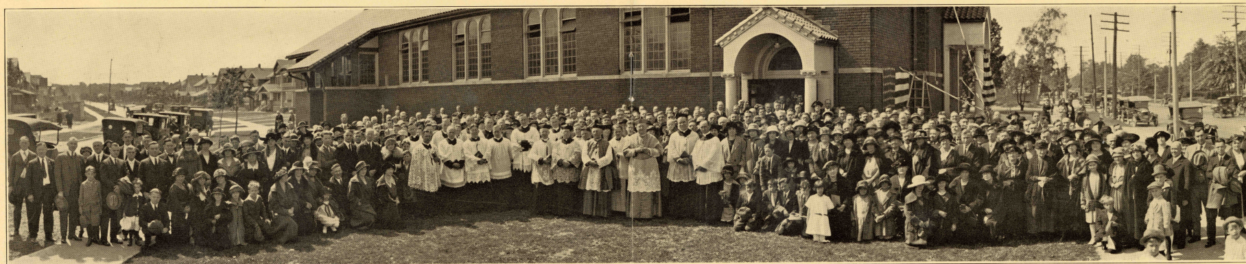
Part of the Crowd on Dedication Sunday, Sept. 16, 1923.

Arched openings at communion rail lead into a small vestibule from which one may enter sacristies or to outdoors.