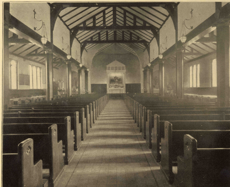
Interior view of St. Clement's Church.

The plan of St. Clement's is the outcome of actual requirement based on utilitarian as well as artistic principles. Whatever beauty it possesses is based on sound and rational planning and construction. Instead of creating a hollow pretending shell St. Clement's parish has achieved the highest degree of fitness and beauty in all its appointments and in doing so have gotten far nearer to the real qualities of the great churches of the past than if they aimed at a mere histrionic reproduction of a cathedral which would give merely the outward semblance of a body from which the soul has fled.